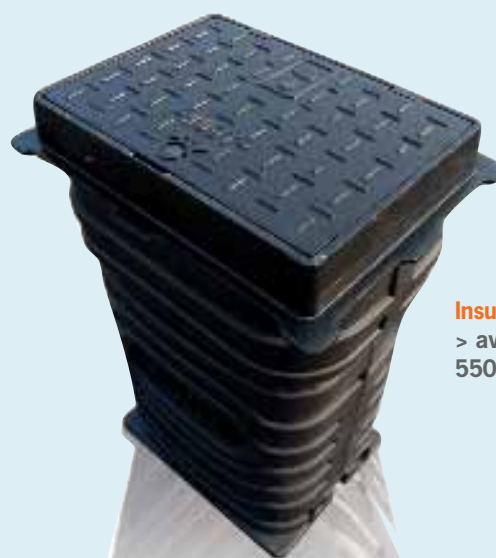
Insulated box : > available in 3 heights : 550, 800 et 1100 mm